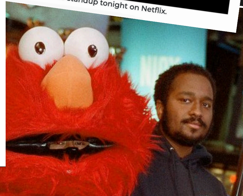
atow returns to standup tonight on Netflix.